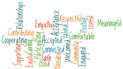
Teamwork in action

Over the next few weeks our staff will continue getting specialized instruction that will key in on the two messages